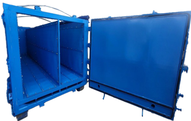
30 CU. YD. PERMANATOR (PERMANENT FILTER)