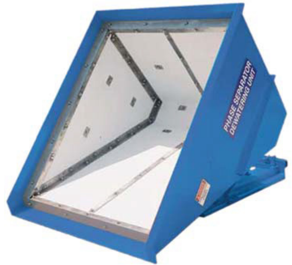
1-5 CU. YD. FIXED FILTER HOPPER