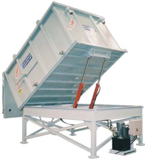
TURBO PHASE SEPARATOR WITH DUMP STAND